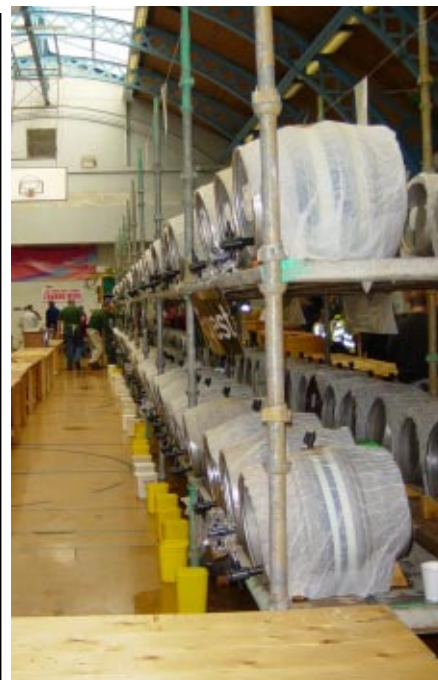
Casks ready for action at the Nottingham Beer Festival

The Horse & Groom, Basford, recently had a packed house when they held a charity Blind Darts Marathon, where both sighted and non or partially sighted teams challenged each other. The sighted throwers were blindfolded in order to balance the odds, and over £200 was raised on the night for Guide Dogs for the Blind, the pubs adopted charity. It is hoped that the event will be repeated again soon.