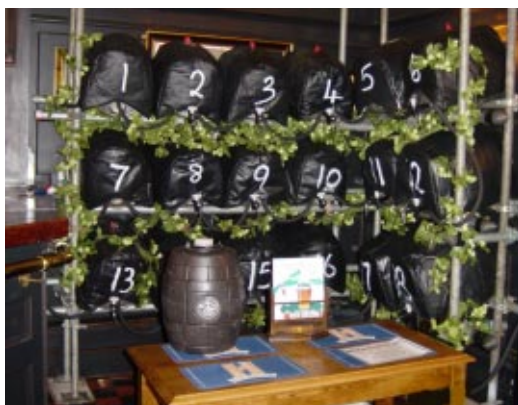
The recent beer festival at the Bell