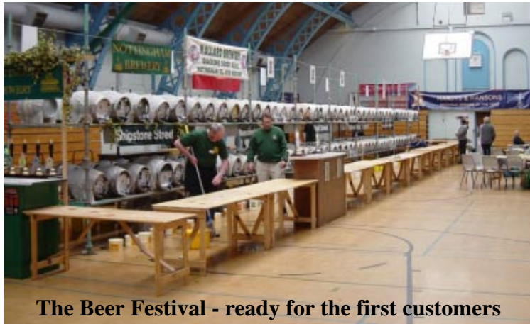
The Beer Festival - ready for the first customers

The selection was as wide as ever, the irritable cellarman being up to his usual standard. He had obtained beer from no less than twenty seven new breweries. Brewers from the local area entered their wares in the regional round of the SIBA Champion Beer competition held at the festival – look out for the results.