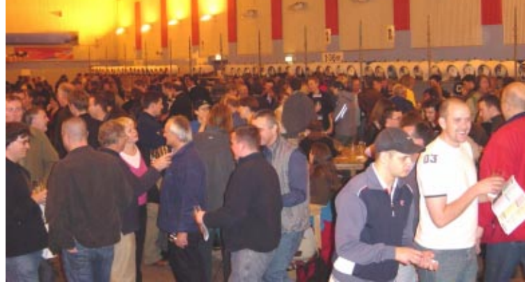
Later - In full swing